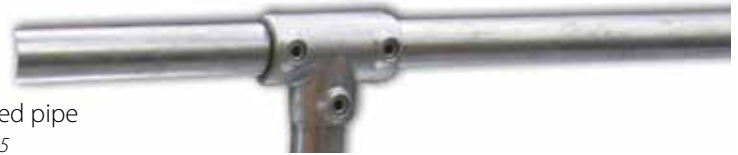
1 1/4" galvanized pipe Item no. 11003005