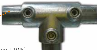
Long T 104C Item no. 11005001