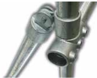
Single swivel 173C Item no. 11005060