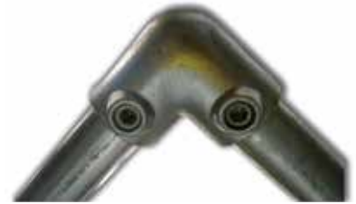
Two way elbow 125C Item no. 11005030