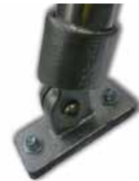
Swivel base 169C Item no. 11005050