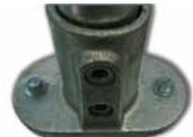
Railing base 132C Item no. 11005040