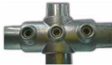
Two socket cross 119C Item no. 11005020