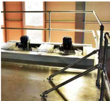
1 1/4" galvanized pipe